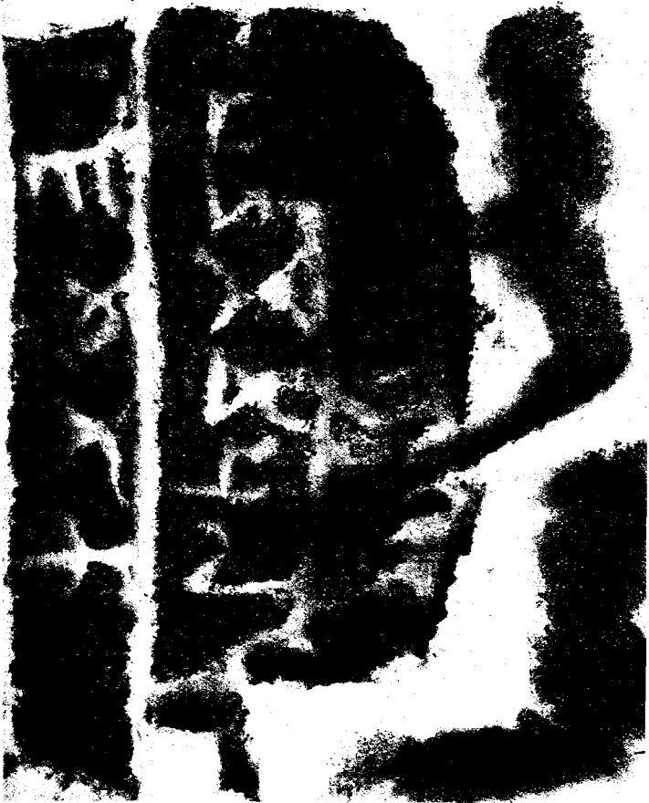
Rajgir (Maniar Math) Image Inscription