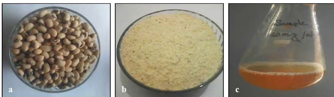
Fig. 1 (a) Seeds of Vigna unguiculata subsp. sesquipedalis , (b) Powdered seeds, (c) Methanolic extract of seeds