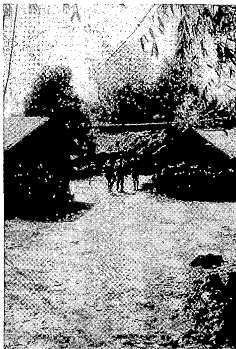
Labour line, Matigara Tea Estate

The plantation provides eight residential areas of the labourers known as 'labour lines' where housing facilities are available for the labour families. In the eight labour lines, known as 7 no line, Gudamline, Station line, Pakka line, 9no. line, 10 no. line, 11 no. line and 12 no. line, labour quarters are scattered. There are 163 labour quarters provided to most of the permanent labourers while some of them and the casual labourers also live in self build thatch roofed houses in the labour lines. Almost all the quarters have about one katha land for kitchen garden. The concentration of population