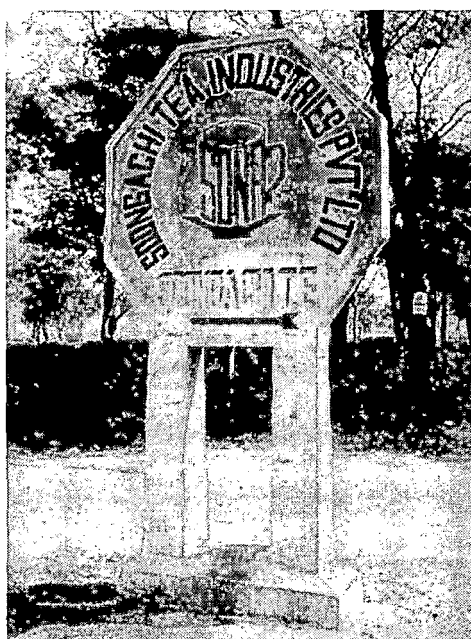
Soongachi Tea Estate

Soongachi Tea Estate is the second tea estate studied. This estate was established in 1879 under Jhemse & Finley Company now owned by M/s.