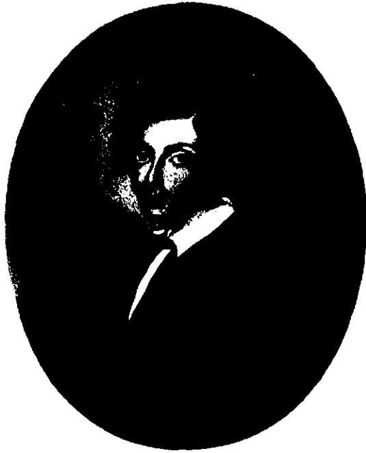
Lord Jafferin as a boy at Eton from a miniature.