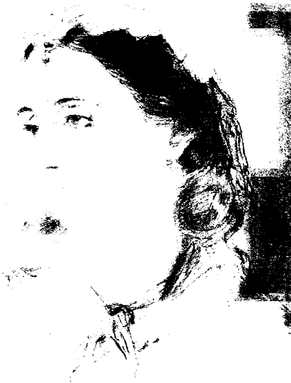
Helen, Lady Dufferin. (Countess of Gifford)