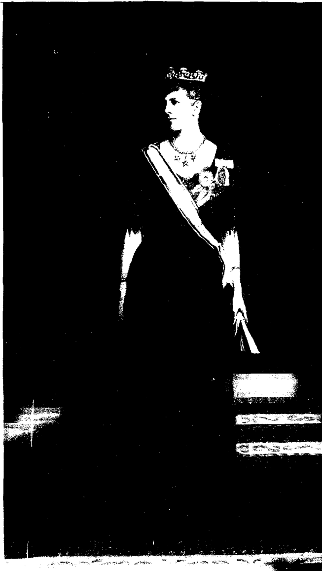
The Marchioness of Sufferin & Ava from the picture by J. J. Shannon, A.R.A. 1889.