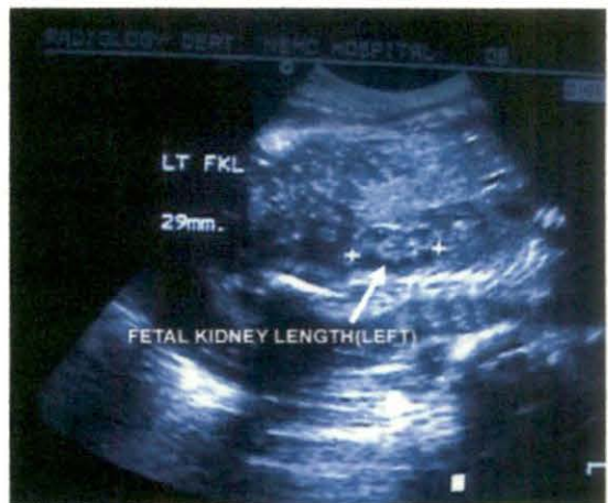
Sonographic measurement of Fetal kidney length

Last of all, it was approached to document the Fetal kidney length (FKL) . At first the transducer (probe) was placed in such manner that the longitudinal view of the fetal spine becomes prominent. Then the probe was moved along paravertebral plane until the long axis of fetal kidney was visualized. At first the left kidney was approached and in case its view was not clear, the right kidney was approached. The kidney lies lateral to the spine and dorsolateral to the abdominal great vessels. With the use of caliper first point