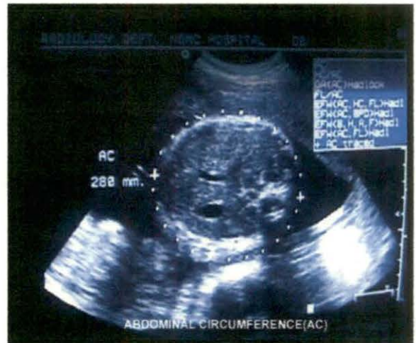
Sonographic measurement of fetal Abdominal circumference

Abdominal circumference (AC) was obtained by placing electronic calipers at the outer perimeter of the fetal abdomen measured on transverse scan at the level of stomach and intrahepatic portion of umbilical vein. This measurement of AC was expressed in millimeter (mm).