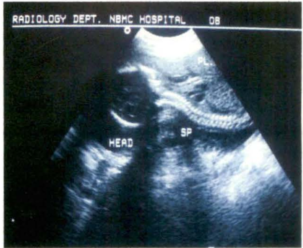
A fetus in the womb, viewed on ultrasonogram. SP = Spine, PL= Placenta

After assessing the fetal number, viability, lie, presentation and fetoplacental anomaly, subjects were selected finally. Then Biparietal diameter (BPD), Head circumference (HC), Abdominal circumference (AC), Femoral length (FL) and Fetal kidney length (FKL) were measured to assess the gestational age.