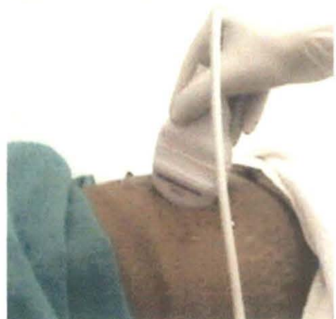
Ultrasonography being performed for fetoplacental profile

Patient was examined in the presence of a nursing staff. Transabdominal ultrasonography was done in optimally distended bladder. Ultrasound Gel was applied over the abdomen prior to probe placement and then sonography was performed.