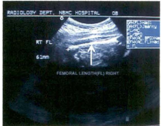
Sonographic measurement of fetal Femoral length

For the purpose of measurement of Femoral length (FL) , fetal spine was traced up to the sacrum and transducer moved to image femur. The length of entire femur was measured by placing electronic calipers at two ends of the femur excluding the thin bright reflection of cartilaginous epiphysis. This measurement of FL was expressed in millimeter (mm).