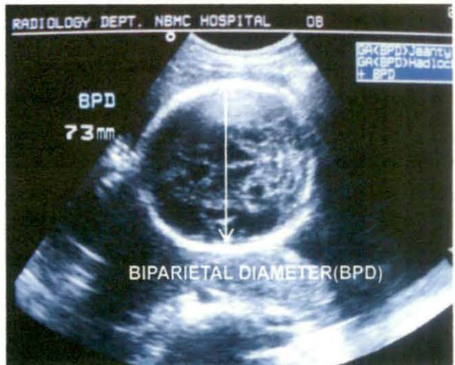
Sonographic measurement of fetal Biparietal diameter

Biparietal diameter (BPD) was measured from the transaxial sonogram of fetal head at the level of paired thalami and cavum septum pallucidum. BPD was measured from the outer edge of the cranium nearest the transducer to the inner edge of the cranium farthest from the transducer. Distance between these two points was defined as BPD and was expressed in millimeter (mm).