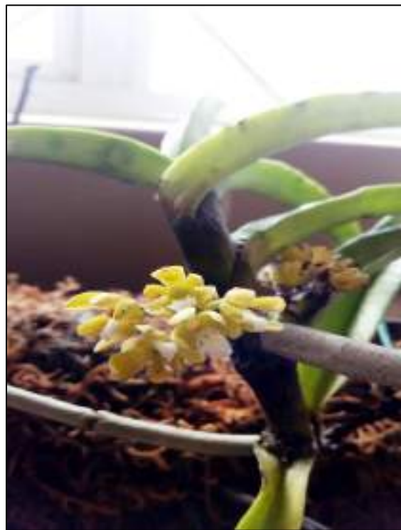
Fig. 3. Inflorescence of Acampe papillosa var flava . A.P. Das et al.

lobes erect, not protruding out; mid-lobe ovate, deflexed, obtuse, erose-undulate, surface densely papillose; spur 2.5 mm long, cylindrical-conical, white-pubescent inside.