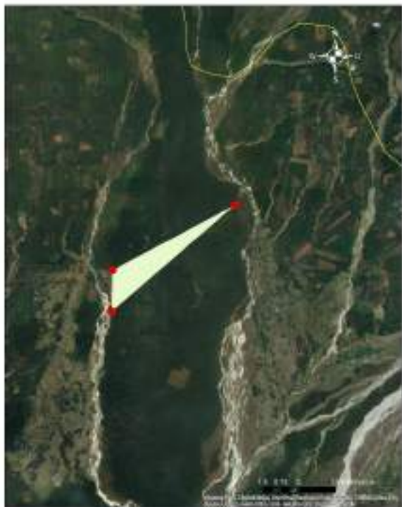
Map 3 Distribution map of Acampe papillosa var flava A.P. Das et al

2.2. Acampe papillosa (Lindl.) Lindl. var. flava Das, Katham & Nirola, Pleione 4(1): 155, f.1. 2010; Sushil K. Singh & al., Orch. India : 35. 2019. Type: Nagarkata, Duars, Jalpaiguri, 17.11.2009; A.P. Das & T.K. Katham 4193 (NBU, not seen).