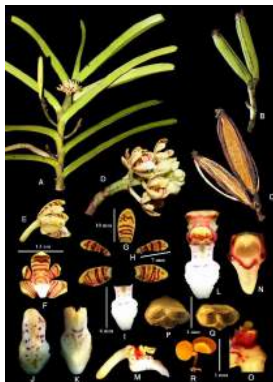
Fig. 4. Acampe praemorsa (Roxb.) Blatt. & McCann: A. Habit; B. Capsules; C. Mature capsule with seeds; D. Inflorescence; E. Side view of flower; F. Front view of flower; G-H. Sepals and Petals; I-K. Labellum; L. Front view of lip and column; M. Labellum & ovary; N. Front view of column; O. Side view of column; P-Q. Anther cap; R. Pollinia.

Wight, Icon. Pl. Ind. Orient. 5: t.1670. 1851. Saccolabium papillosum auct. non. Lindl.: Wight, Icon. Pl. Ind. Orient. 5: 9, t.1672. 1851; Dalzell & Gibson, Bombay Fl.: 264. 1861. Acampe excavata Lindl., Fol. Orchid. 4 (Acampe): 3. 1853. Saccolabium praemorsum (Roxb.) Hook.f., Fl. Brit. India 6: 62. 1890 (excl. syn. Aerides undulata ). non. (Willd.) Lindl. nom. illeg. ; Prain, Bengal Plants: 1022. 1903; Haines, Bot. Bihar Orissa 6: 1180. 1924. Gastrochilus praemorsus (Roxb.) Kuntze, Revis. Gen. Pl. 2: 661. 1891. Acampe wightiana (Lindl. ex-Wight) Lindl. Fol. Orchid. 4 (Acampe): 2. 1853; T. Cooke, Fl. Pres. Bombay 2: 705. 1907; C.E.C. Fisch. in Gamble, Fl. Pres. Madras 3: 1447. 1928. Vanda fasciata Gardner ex Lindl. Fol. Orchid. 4