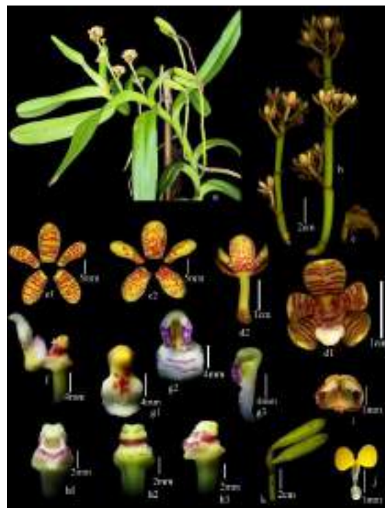
Fig. 5 Acampe rigida (Buch.-Ham. ex Sm.) P.F. Hunt: a. Habit; b. Inflorescence; c. Bract; d1 - d2. Flower (front and back view); e1 - e2. Sepals & petals (ventral and dorsal view); f. Labellum with column; g1 - g3. Labellum (front, back and side view); h1 - h3. Column (front, back and side view); i. anther cap; j. pollinia; k. capsules.

distichous, all along the stem, 10–45 × 3–5 cm, fleshy, oblong, obtuse, unequally and obliquely 2-lobed, mid-vein thickened below, base articulate, sheathing, lignified and striated at maturity.