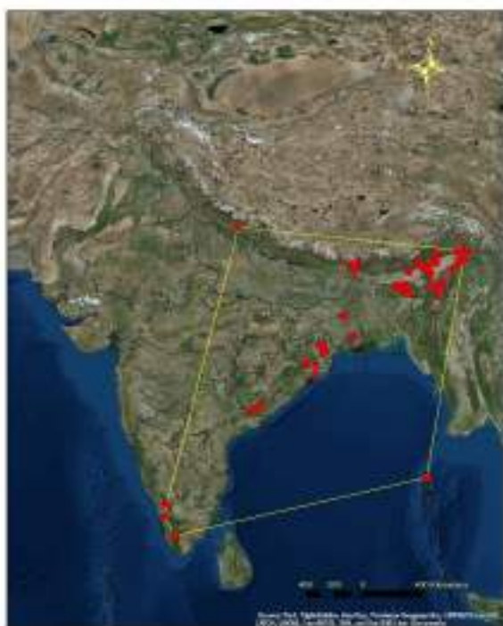
Map 5 Distribution map of Acampe rigida (Buch.-Ham. ex Sm.) P.F. Hunt

Arunachal Pradesh: 39. 1998. Acampe longifolia