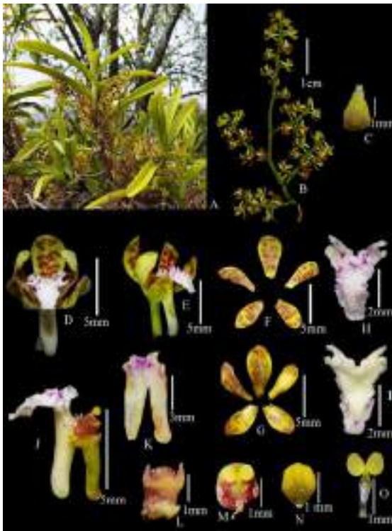
Fig. 1 Acampe ochracea (Lindl.) Hochr.: A. Habit; B. Inflorescence; C. Bract; D. Flower (front view); E. Flower (side view); F. Sepals & petals (ventral view); G. Sepals and petals (dorsal view); H. Labellum (ventral view); I. Labellum (dorsal view); J. Labellum with column, pedicel and ovary; K. L.S. of spur; L. Column; M. Column with pollinia; N. Anther cap; O. Pollinia.

Karnataka 3: 12. 2019; Sushil K. Singh & al., Orch. India: 35. 2019. Type: Sri Lanka (Ceylon), Horton, cult. Loddiges s.n. (holo. K- LINDL, photo!). Saccolabium ochraceum Lindl., Bot. Reg. 28: misc.2, no.4. 1842; Hook. f. Fl. Brit. India 6: 62. 1890p.p.; King & Pantl., Ann. Roy. Bot. Gard. Calcutta 8: 219, t. 291. 1898; Prain, Bengal Plants: 768. 1903. Acampe dentata Lindl., Fol. Orchid. 4 (Acampe): 3. 1853. Saccolabium lineolatum Thwaites, Enum. Pl. Zeyl.: 304. 1864. Acampe griffithii Rchb.f. in Flora 55: 277. 1872. Gastrochilus ochraceus (Lindl.) Kuntze., Revis. Gen. Pl. 2: 661. 1891.