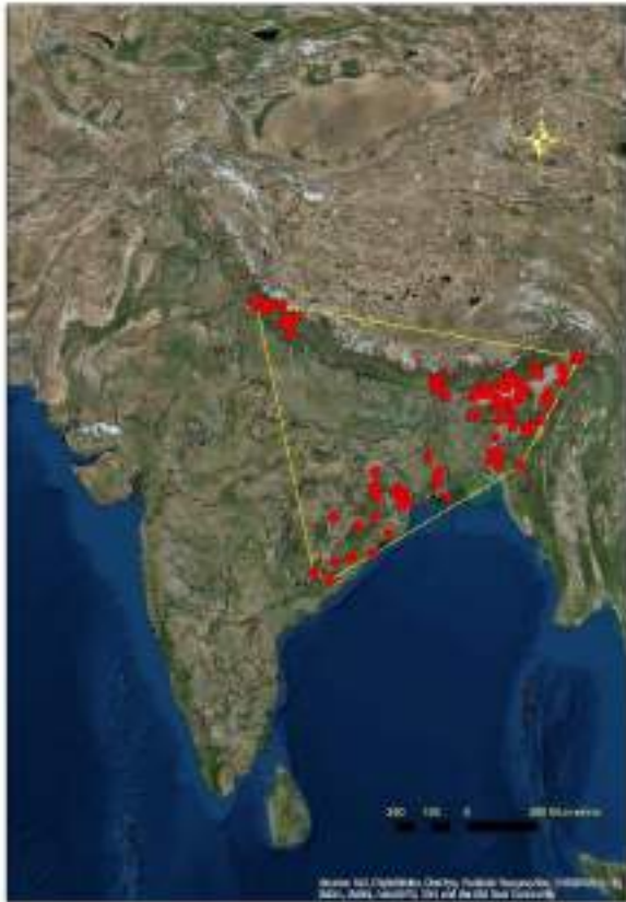
Map 2 Distribution map of Acampe papillosa (Lindl.) Lindl.

Uses: This species has been cultivated at some commercial Orchid nurseries and got good potential for a potted ornamental for foliage and can be hanged in lobbies and verandas.