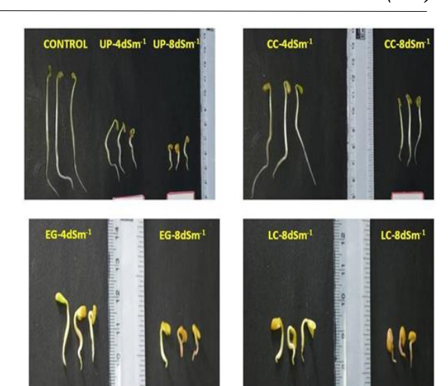
Fig.1 Fenugreek seedlings at various salinity level under influence of calcium elicitors

assessment of the extent of salinity induced effects and the degree of tolerance in plants towards stress environment. Our findings suggest the positive effect of exogenous calcium priming on the RWC of fenugreek seedlings under salinity stress was in agreement to previous studies on several plants (Khan et al., 2010). The seedlings subjected to calcium chloride priming exhibited minimal reduction in root elongation during saline stress, which is considered to be one of the major physiological parameter for salinity tolerance (Tari et al., 2015). Like calcium ion another signalling molecule, nitric oxide is also reported to mitigate salinity stress in plants (Ahmad et al., 2016). Furthermore, the stress tolerance index was significantly enhanced by the calcium chloride pretreatment as compared to control, on the other hand the decline in tolerance index under the influence of calcium antagonist suggest potential role of calcium ion in providing tolerance to plant against salinity (Table 1).