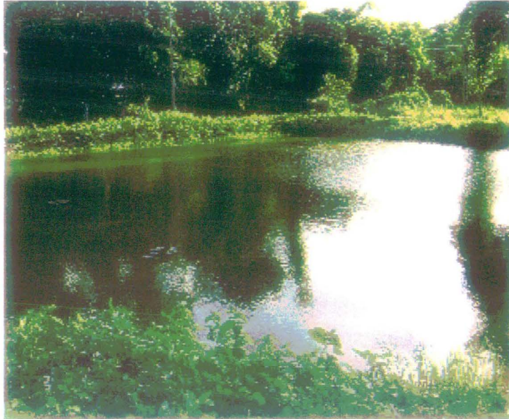
Photograph-17: Village Pond