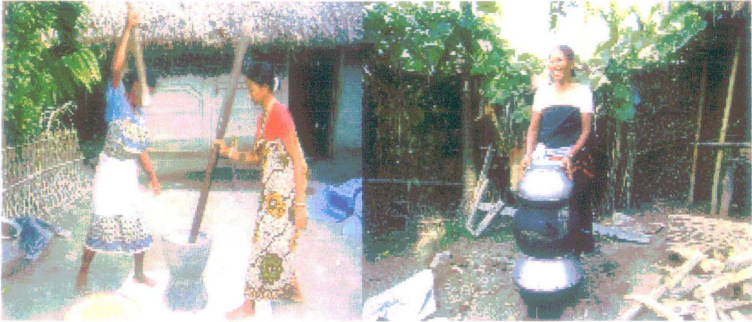
Photograph-10: Processing Rice