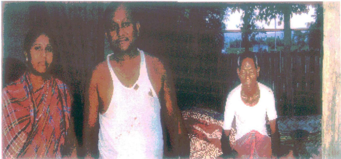
Photograph-33: Dhimal Couple