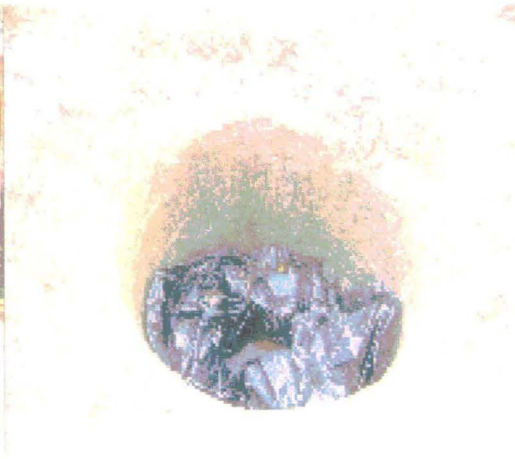
Photograph-26: Processing of Beetle nut