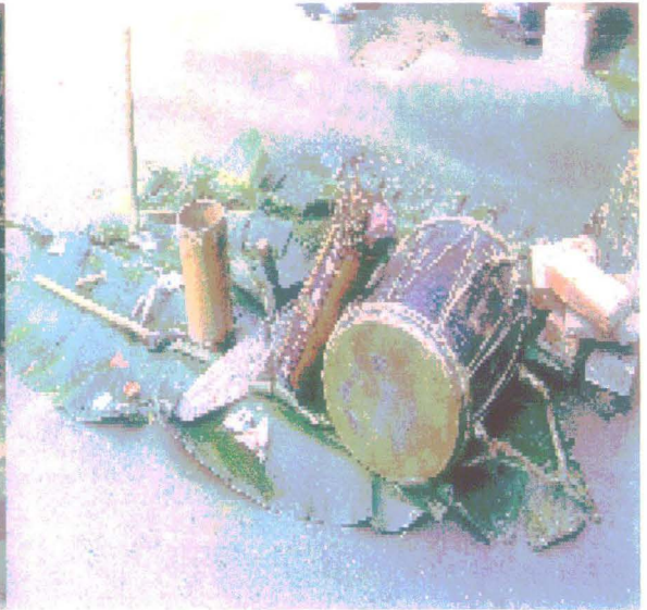
Photograph- 39: Worshipping Material objects