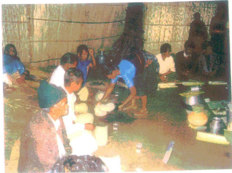
Photograph- 35: Serving food during Obsequial ceremony ( Bhonoipika )