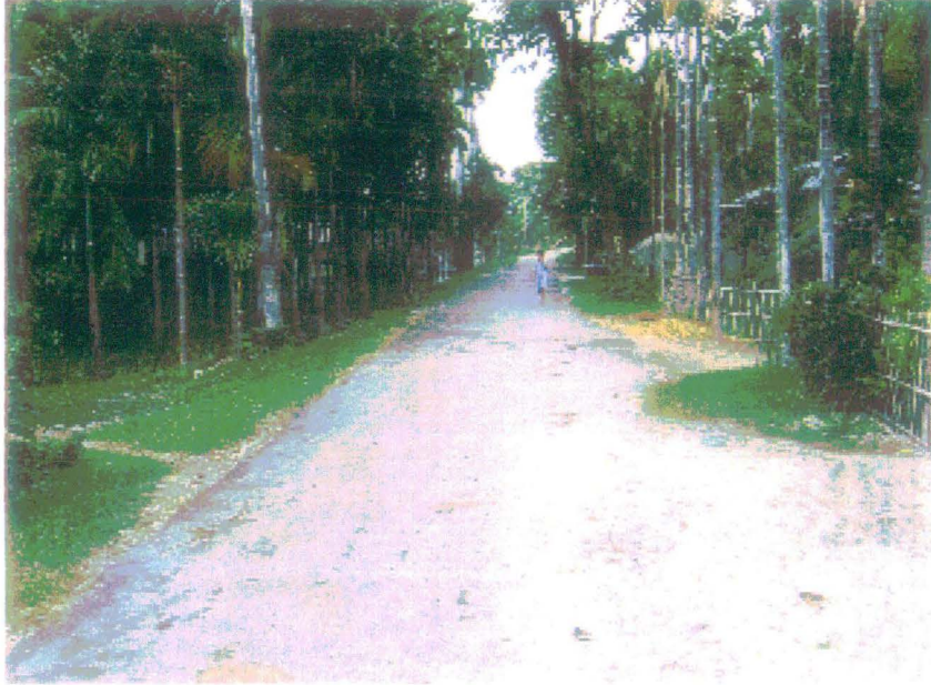
Photograph-4: A way to the Village