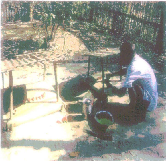
Photograph-38: Busy in worshipping