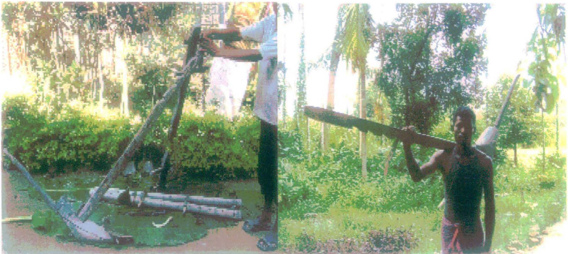
Photograph-21: Major Agriculture equipments