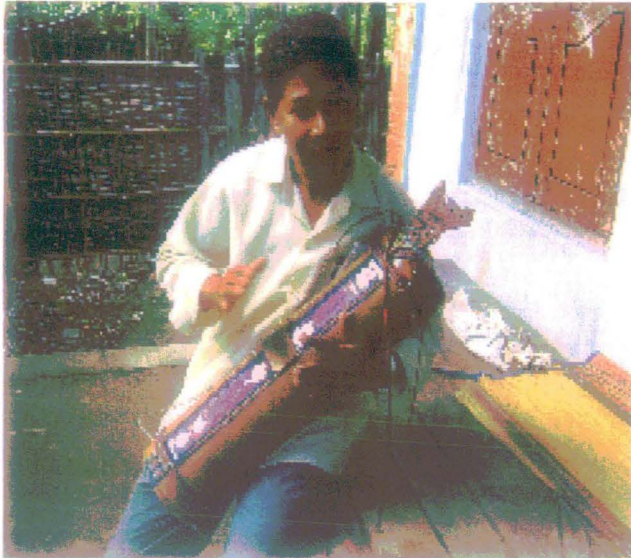
Photograph-27: Playing Chonga-Merdong