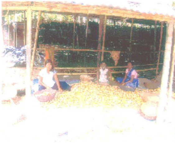
Photograph-25: Sorting of Beetle nut for sell