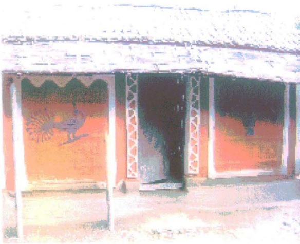
Photograph-5: Typical House type