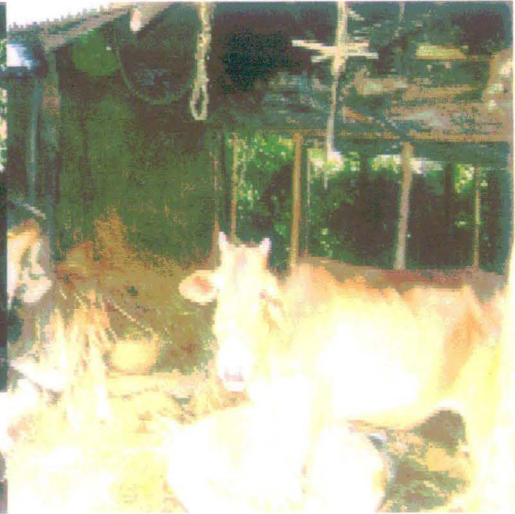
Photograph- 24: Cow in Cow shed