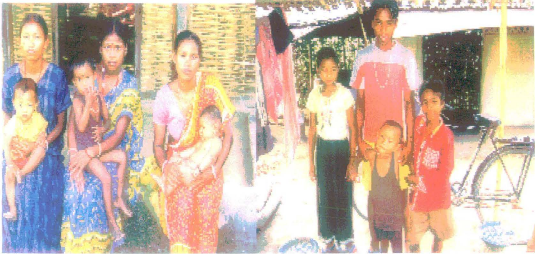
Photograph-31: Mother and Children