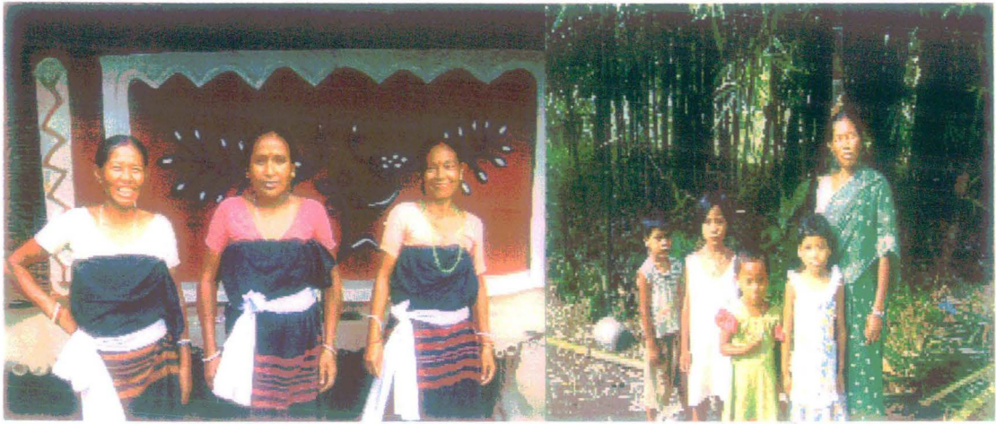
Photograph-7: Dhimal women with traditional dress Photograph-8: Changing dress pattern