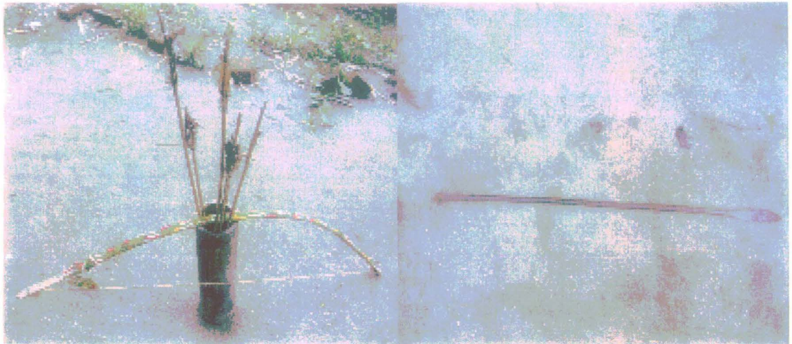
Photograph- 15: Bow and Arrow