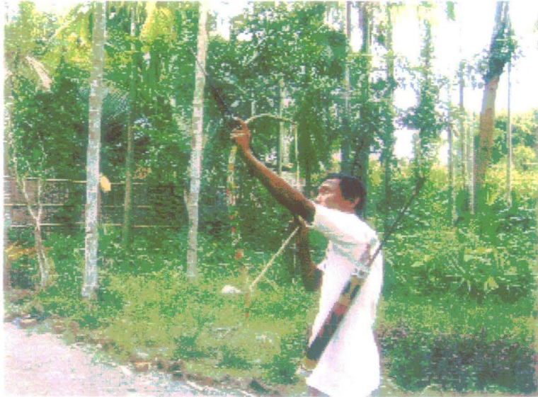
Photograph-14: Hunting by Bow and Arrow