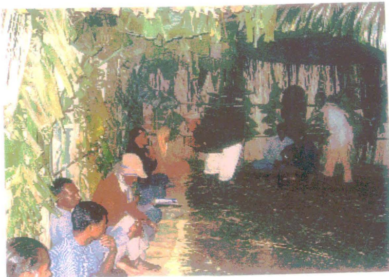
Photograph- 36: Guests are honoured with Yu