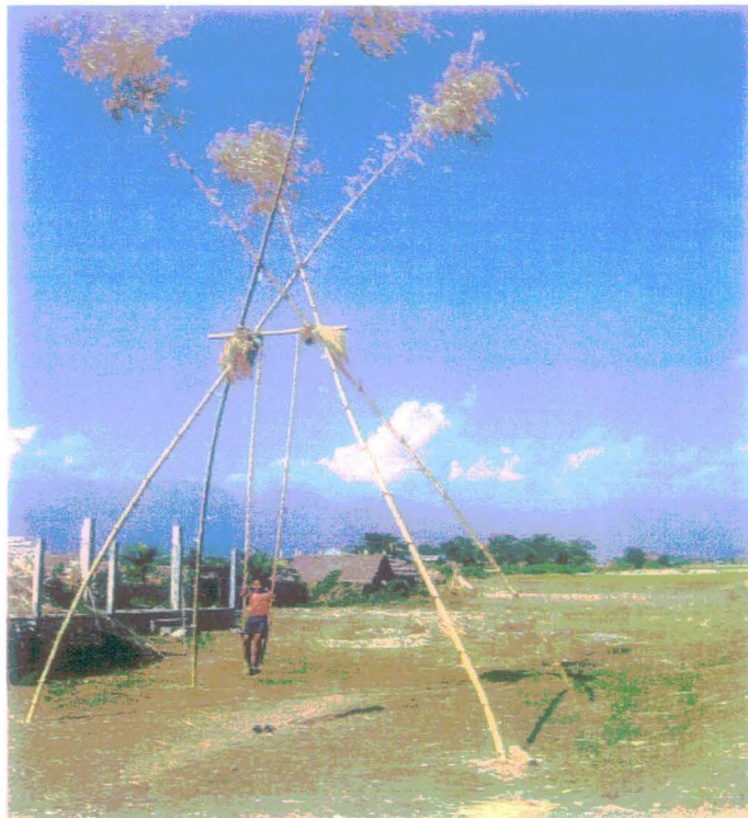
Photograph-42: Amusement for a Dhimal Boy