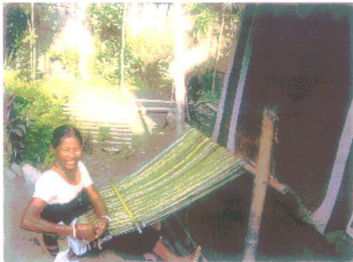
Photograph-9: Dhimal woman busy in weaving