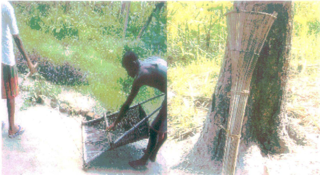
Photograph-18: Demonstration of fishing technique by using Banga