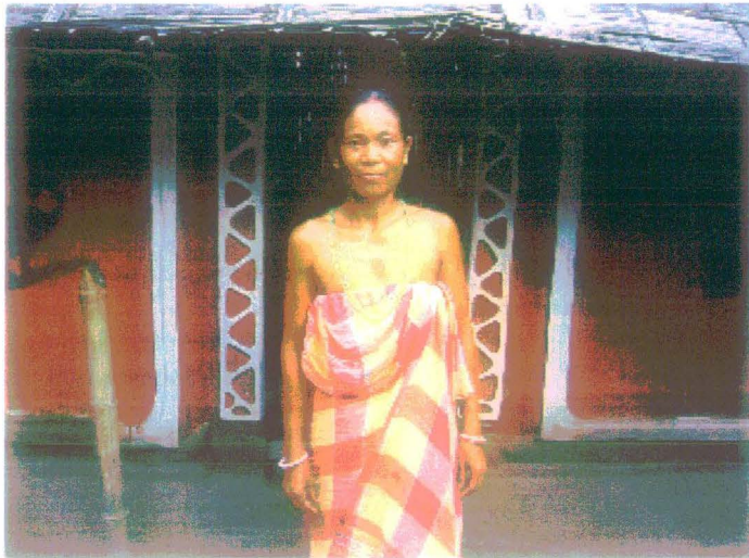
Photograph-1: A Dhimal Woman