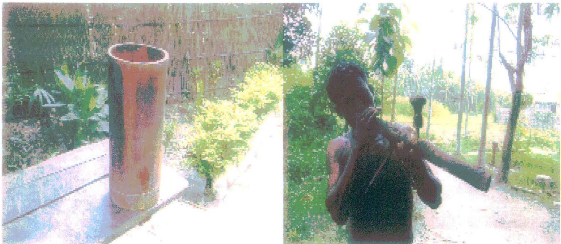
Photograph-12: Traditional Container