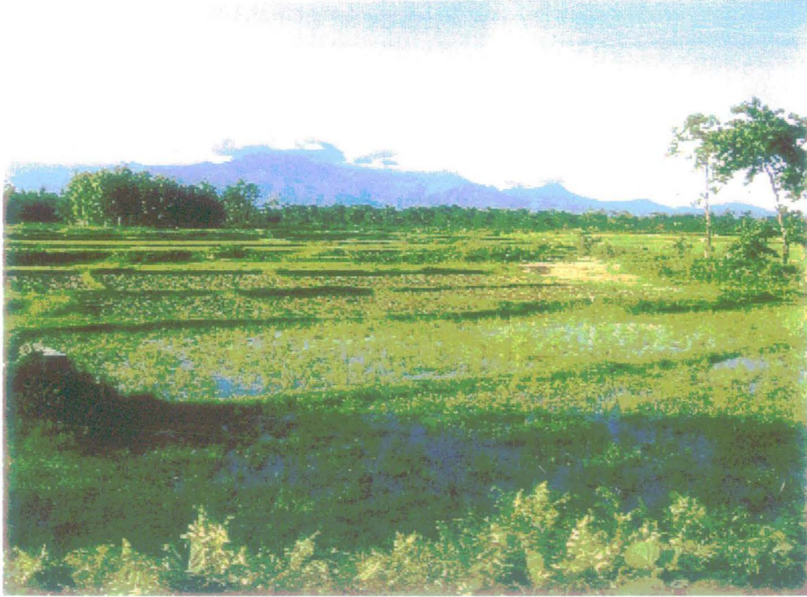
Photograph-20: Paddy Field