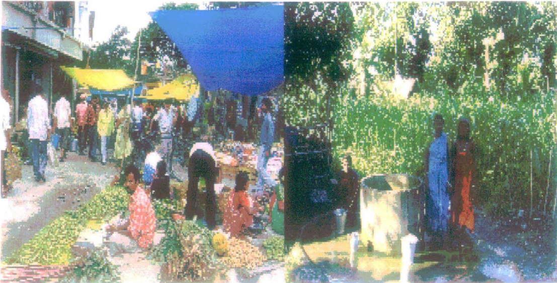
Photograph- 40: Market place at Naxalbari