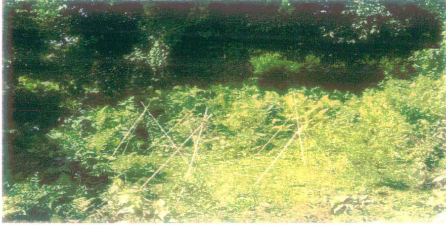
Photograph-37: The Sacred Place- Gram Than