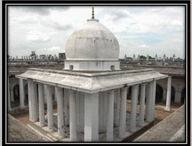
Imambara constructed by Feradun Jha in 1848