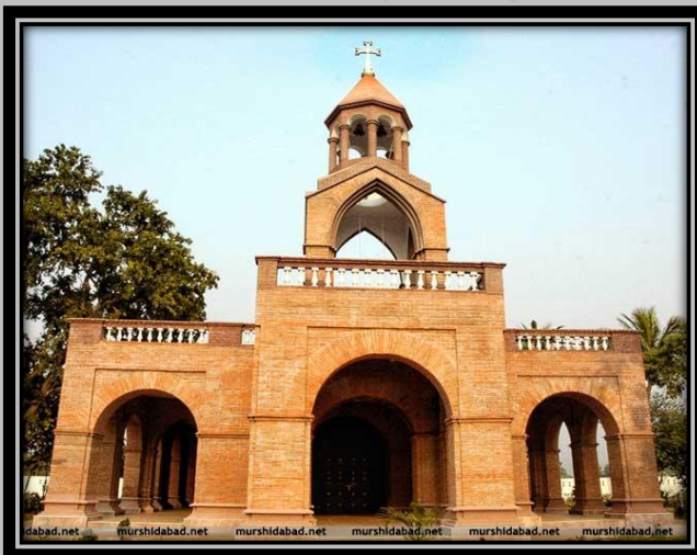
Armenian Church In 1758 it was built by London Missionary Society in Saidabad under Beharampore subdivision.