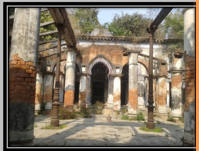
Nimtita Rajbari Thakurdalan

In 1843 jamidar Gourisundar Chowdhury and Dwarakanath Chowdhury built this palace but at present it turned into a delapidated building.