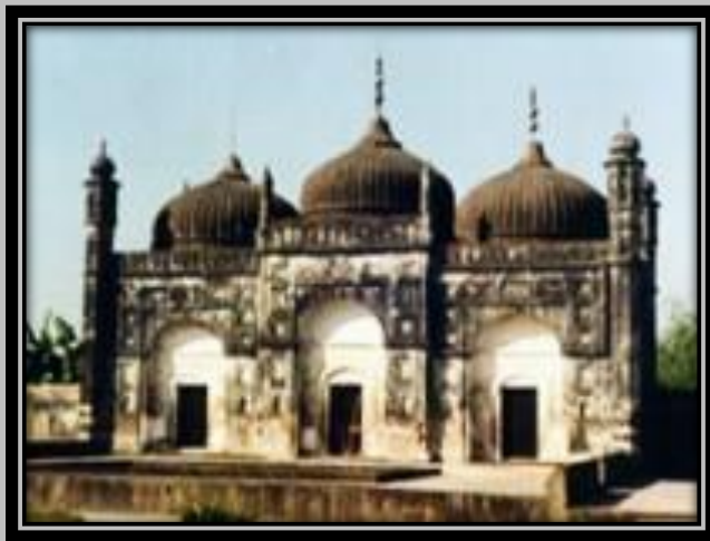
Srirajduallah's Tomb In 1760 it was made by the member of Sriraj's family.