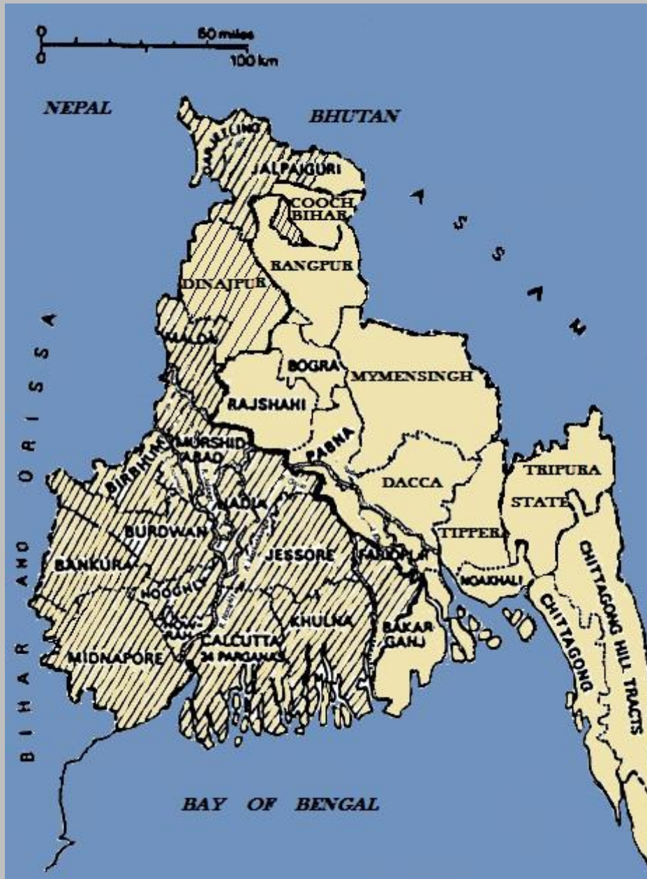
The Boundary Line Proposed by the Hindu Mahasabha and the New Bengal Association. (the shaded area shows the proposed limits of West Bengal).