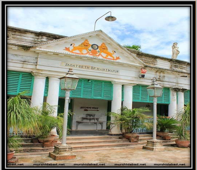
House of Jagat Seth

In 1906 it was constructed by Nawab Bahadur of Murshidabad Wasif Ali Mirza.