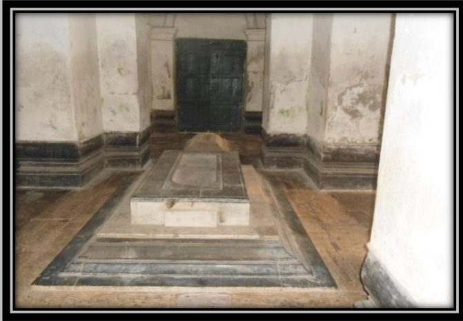
Cemetery of Srirajduallah In 1740 these cemetery are constructed by the members of Sriraj's family.