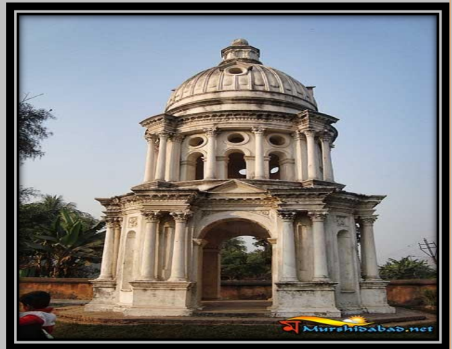
Dutch Cemetery It was built by the British after their victory in Murshidabad in 1759.