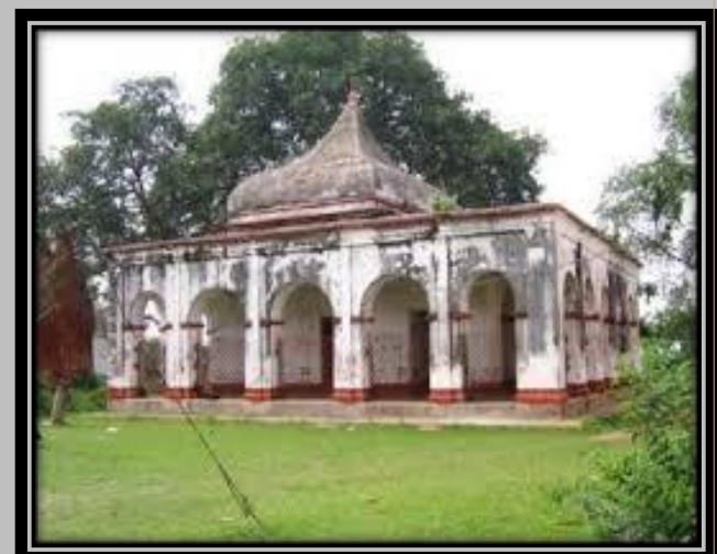
Kereteshwari Mandir In 1278 it was established by the raja of Azimganj.