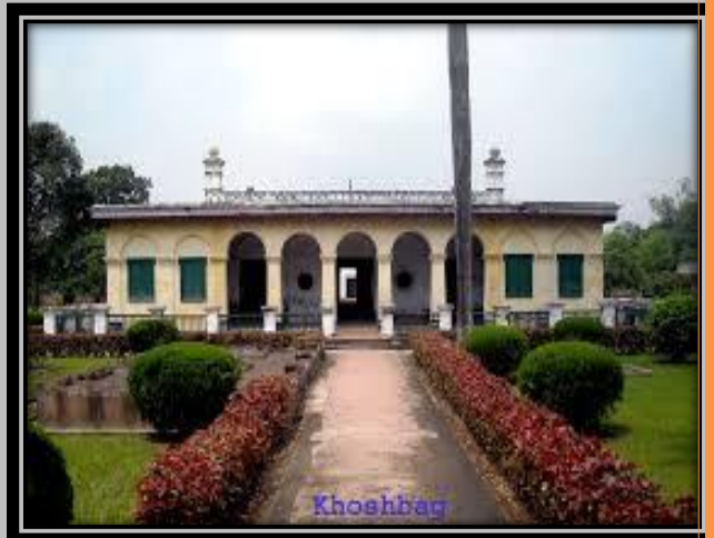
Khoshbagh Srirajudullah's death place