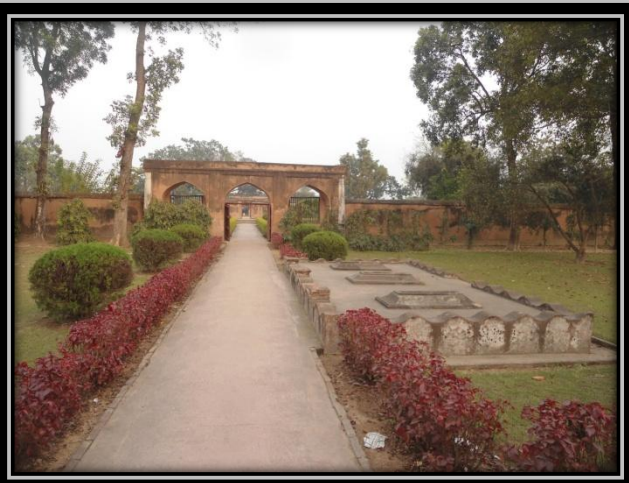
Gate of Khoshbagh