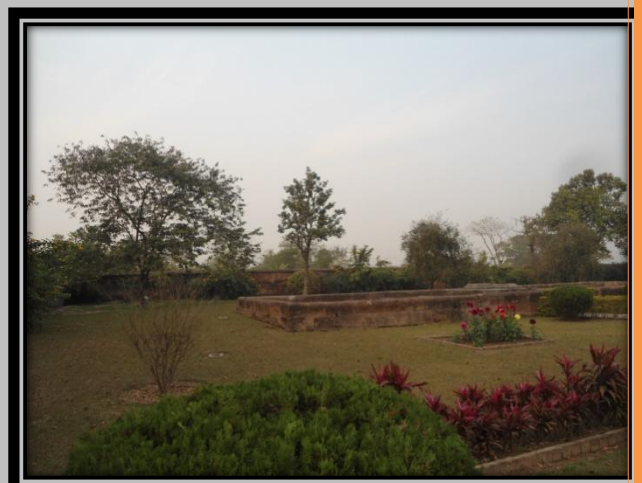
Garden inside Khoshbagh Cemetery