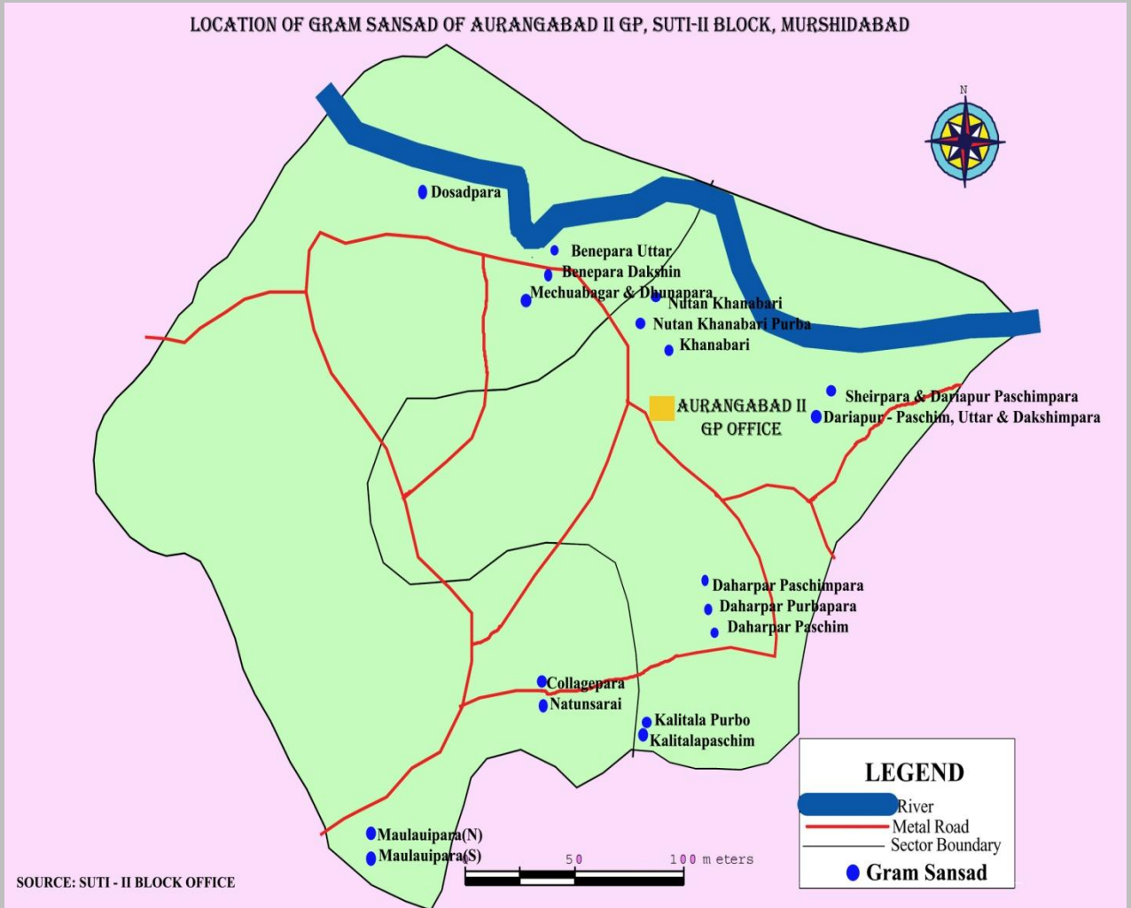
Area Demarcation of Aurangabad II Gram Panchayat and the location of the Gram Sansads