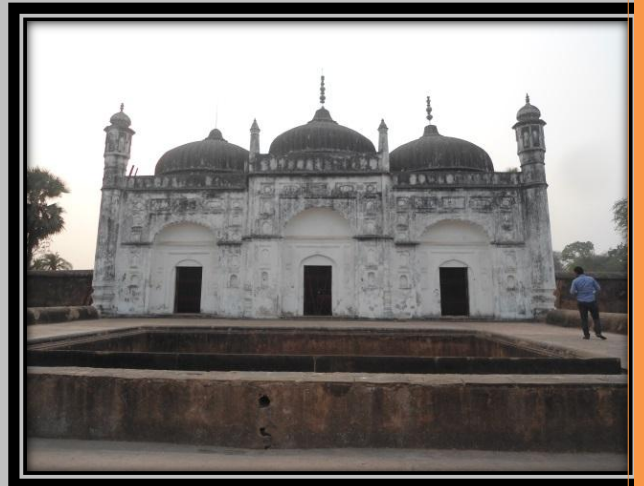
Mosque inside Khoshbabg Cemetery It was made by Srirajduallah in 1770.