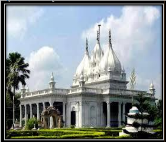
Katgola Jain Temple