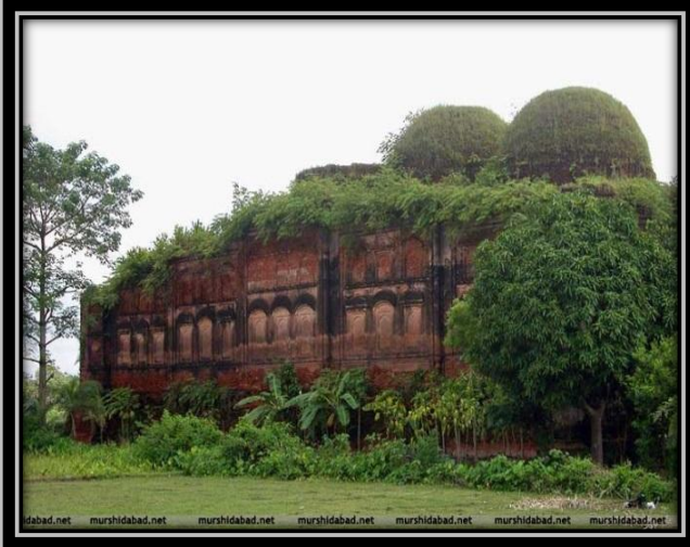
Footi Masjid In 1740 it was built by Sarfaraj Khan.