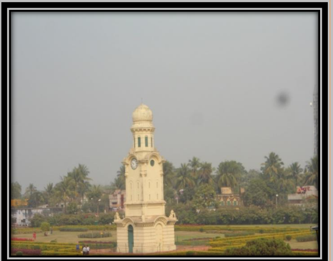
A Historical Watch inside Hazarduari Palace