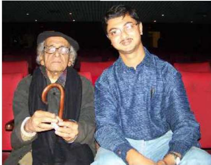
A moment of interaction with theatre doyen Padmashree (Late) Habib Tanbir