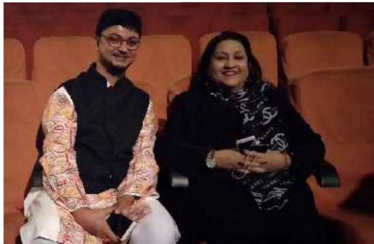
After an interview with Actor/Director Nadira Babbar.