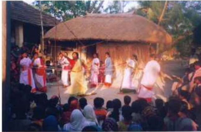
Janasankruti performing in the household compound