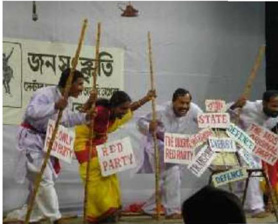
Janasankruti performing Women's issues