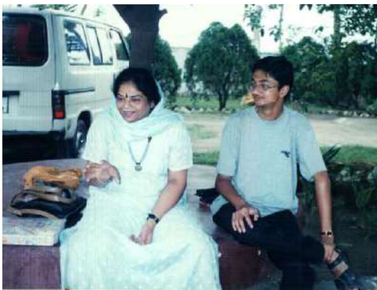
An intimate interaction with Director Usha Ganguly.