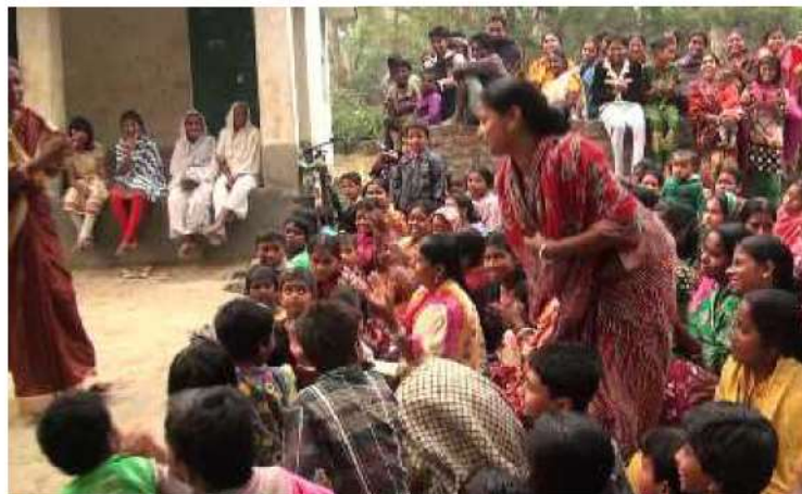
A moment of INTERVENSION in Janasanskriti's performance.