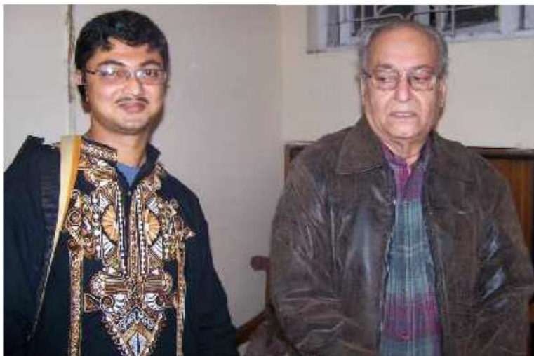
In conversation with Actor/Dramatist Soumitra Chattopadhyay.