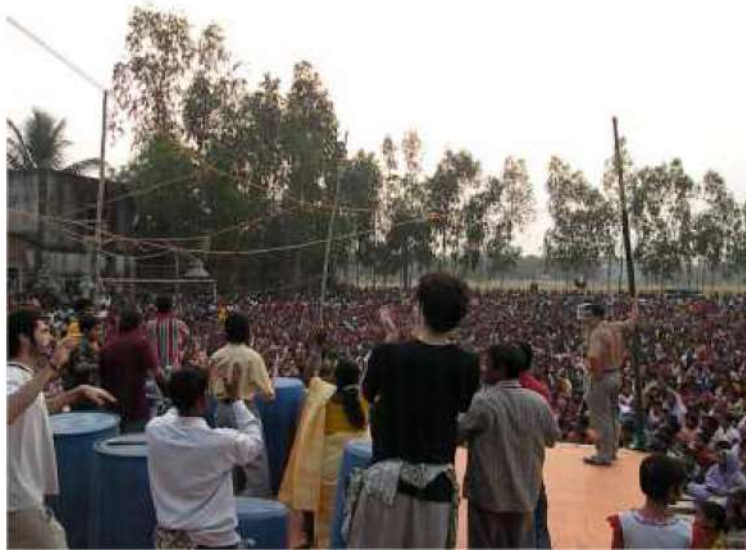
Janasanskriti show gathering and desi drum performance