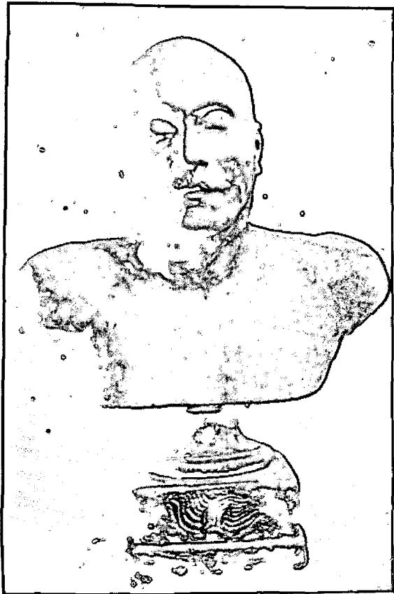
Death-Mask of Raja Rammohun Roy now in the possession of the Rammohun Library and Free Reading Room, Calcutta.