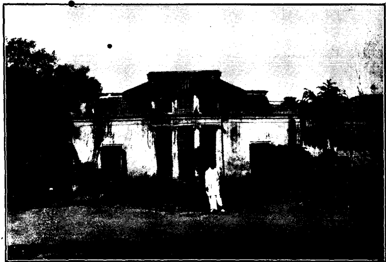
Raja Rammohun Roy's Residence, 113, Upper Circular Road, Calcutta. •