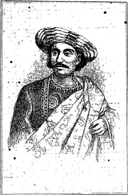
PRINCE DWARKA NATH TAGORE.