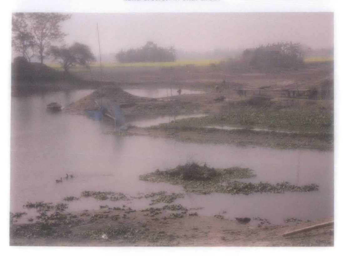
Marshy land surrounding char areas