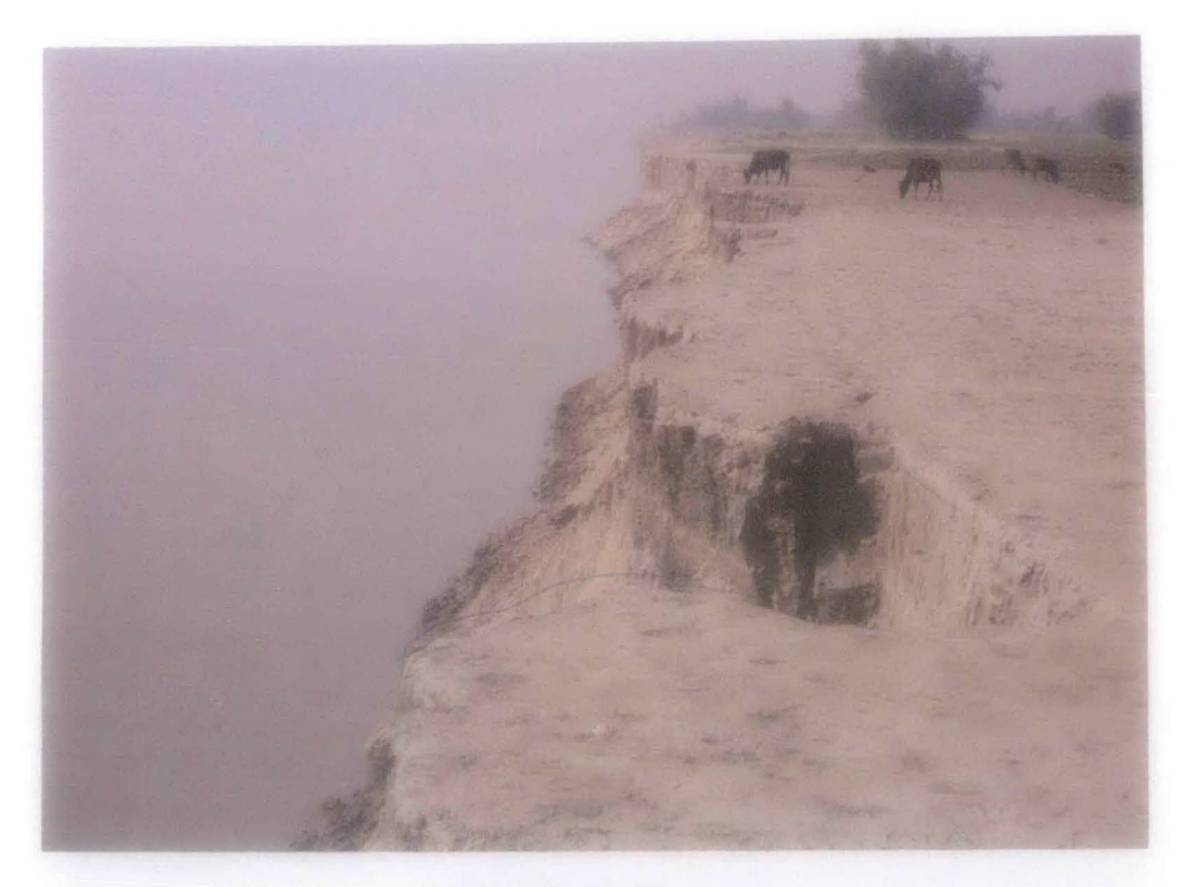
Land erosion in char areas