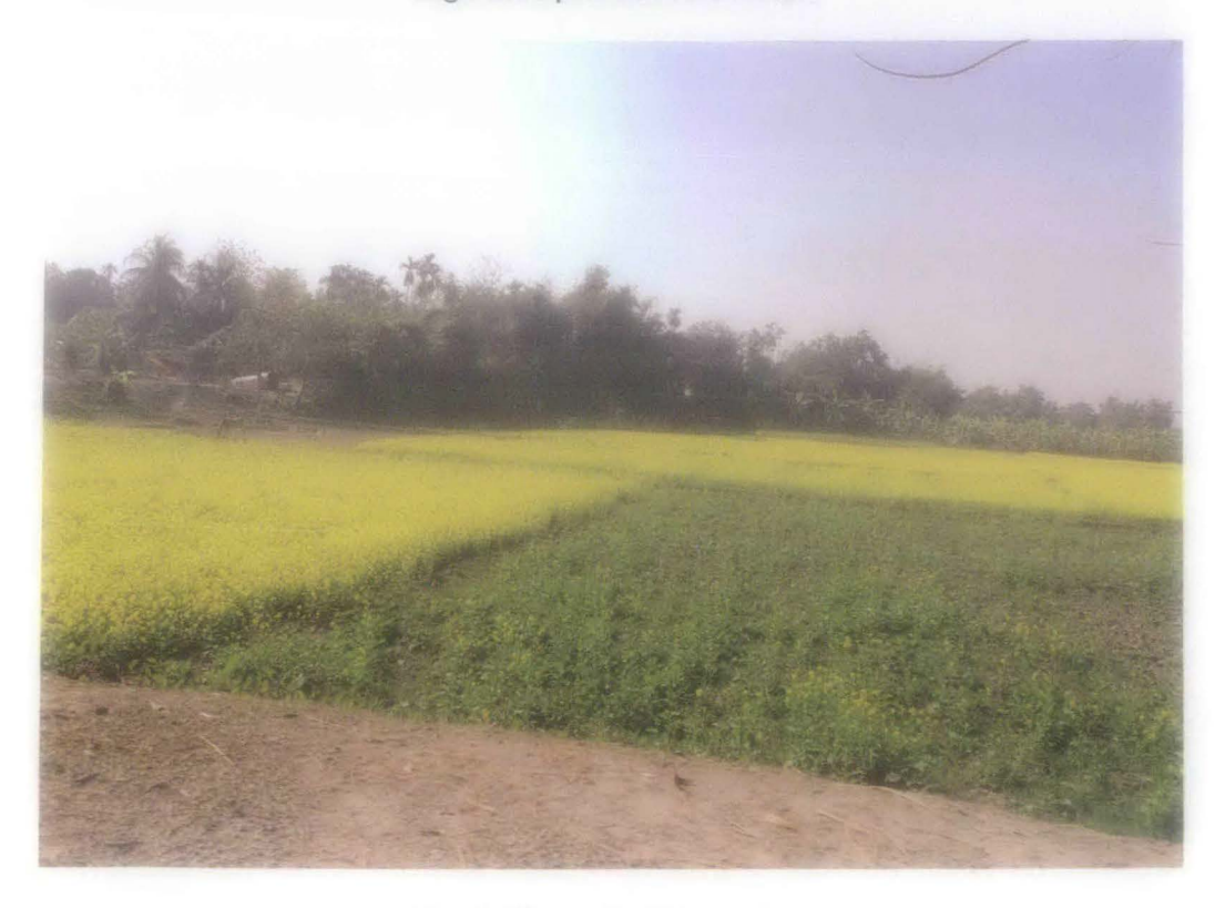
Vegetable production on char