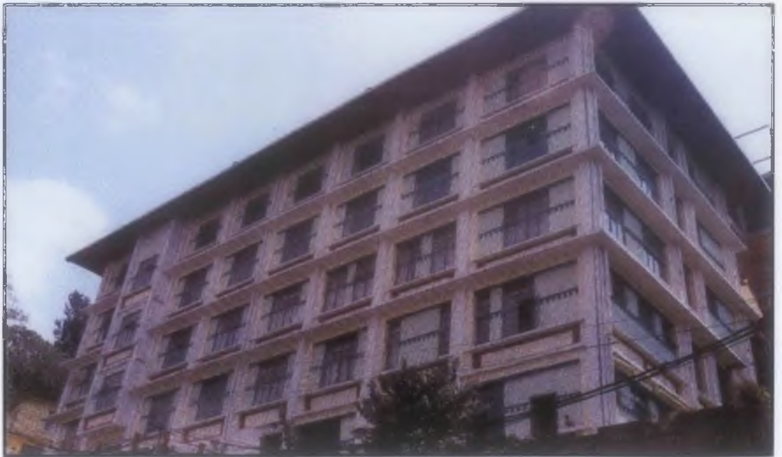
SIKKIM HIGH COURT