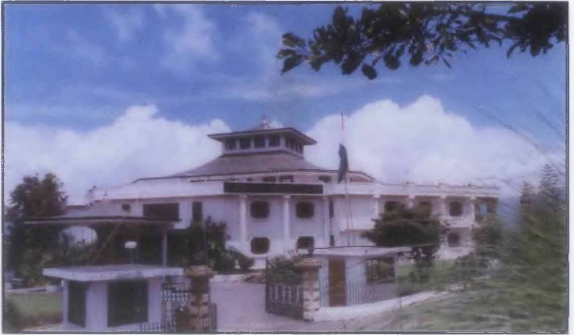
SIKKIM LEGISLATIVE ASSEMBLY