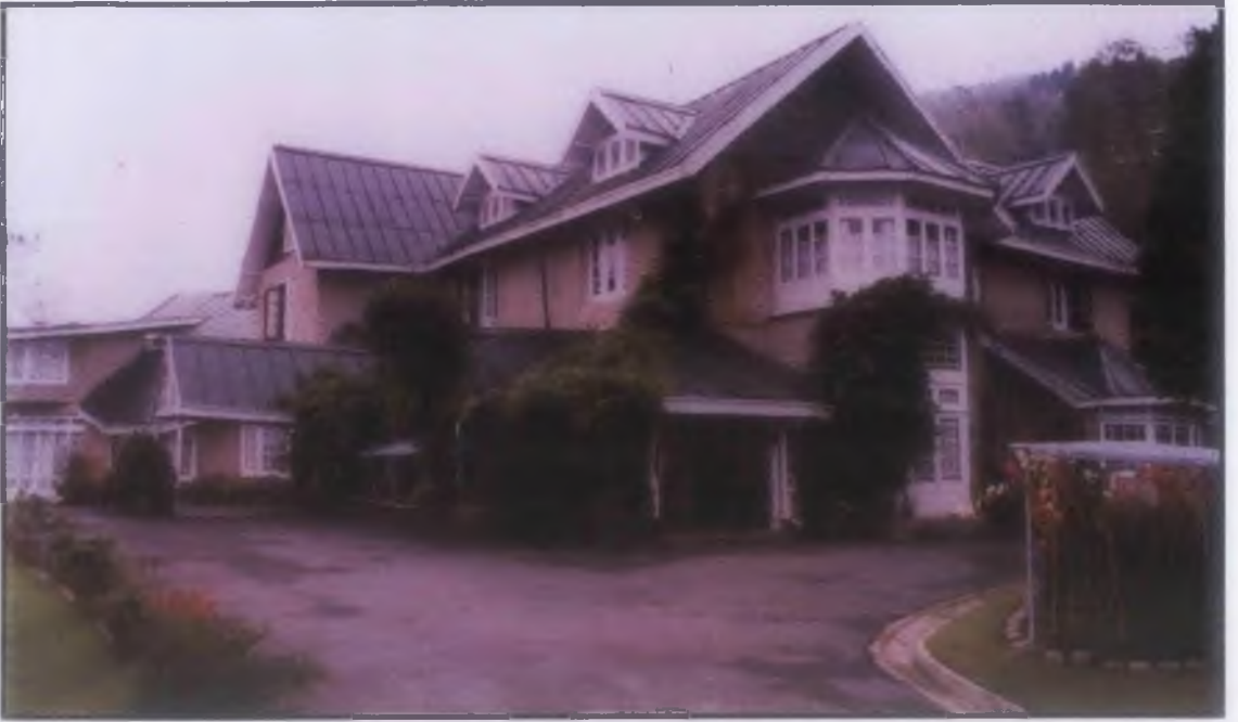
SIKKIM: RAJ BHAVAN