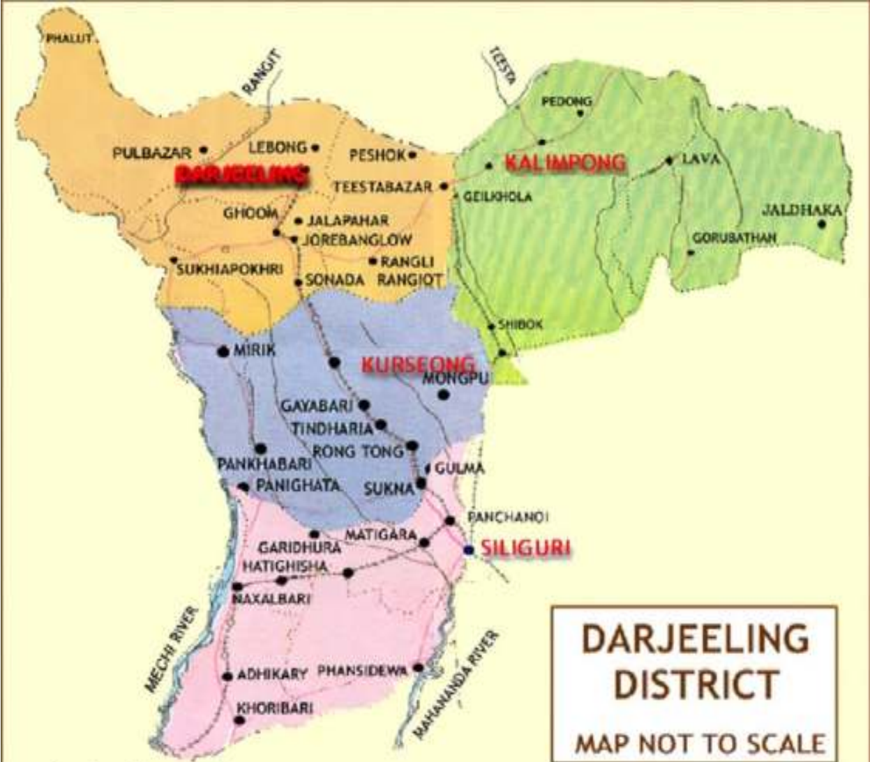
a darjeelingpolice.com map